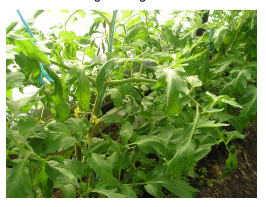
The first cucumbers will be picked this week. 18<sup>th</sup> Nov 2010.

That means the potash level is about correct, too much Nitrogen and the trusses are further apart and the plant is open to disease when the level of nitrogen is high.